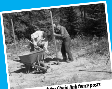
Cement work for Chain link fence posts and new horseshoe pits!

TO ESTABLISH AND OPERATE A COMMUNITY HALL AND PARK THAT IS AVAILABLE FOR THE GENERAL USE OF THE PUBLIC FOR A VARIETY OF COMMUNITY ACTIVITIES INCLUDING: WORKSHOPS, PROGRAMS, DRAMA, ART, MUSIC, HANDICRAFTS, HEALTHY RECREATION AND INCIDENTAL ACTIVITIES.