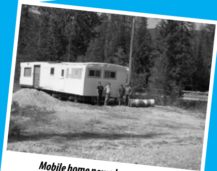
Mobile home now placed at site.