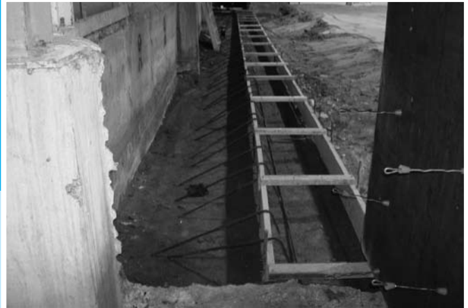
Curling Rink Footing

In the curling rink, forming has been started for the header trench footing (the header trench is the area under the north walkway that houses the main refrigeration brine pipes) as well as the footing to support the curling lounge viewing area over sheets 3 to 6. The floor has been partially backfilled and tamped, ready for the thermal storage piping which will serve the purposes of under slab freezing protection as well as the method that we will be storing the excess heat recovered from the refrigeration compressors. After the piping, more sand is placed and tamped, then Styrofoam, then the construction of the refrigerated slab which is a macramé of steel mesh, rebar and refrigeration brine lines.