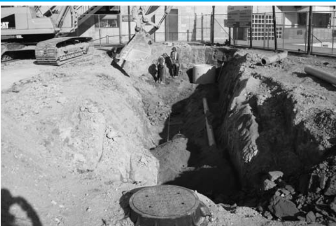
Final Work On Sewer And Stormwater Lines

The excavation is well underway for the aquatic portion – many loads of soil will be hauled away in preparation for the engineered backfill and building footings.