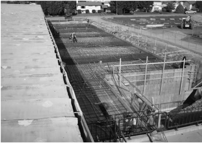
Arena Roof Top