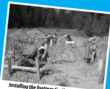
Installing the footings for the mobile home at Community site.