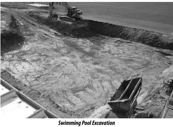
Swimming Pool Excavation

In the curling rink, forming has been started for the header trench footing (the header trench is the area under the north walkway that houses the main refrigeration brine pipes) as well as the footing to support the curling lounge viewing area over sheets 3 to 6. The floor has been partially backfilled and tamped, ready for the thermal storage piping which will serve the purposes of under slab freezing protection as well as the method that we will be storing the excess heat recovered from the refrigeration compressors. After the piping, more sand is placed and tamped, then Styrofoam, then the construction of the refrigerated slab which is a macramé of steel mesh, rebar and refrigeration brine lines.