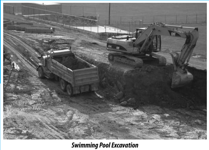
Swimming Pool Excavation

The excavation is well underway for the aquatic portion – many loads of soil will be hauled away in preparation for the engineered backfill and building footings.