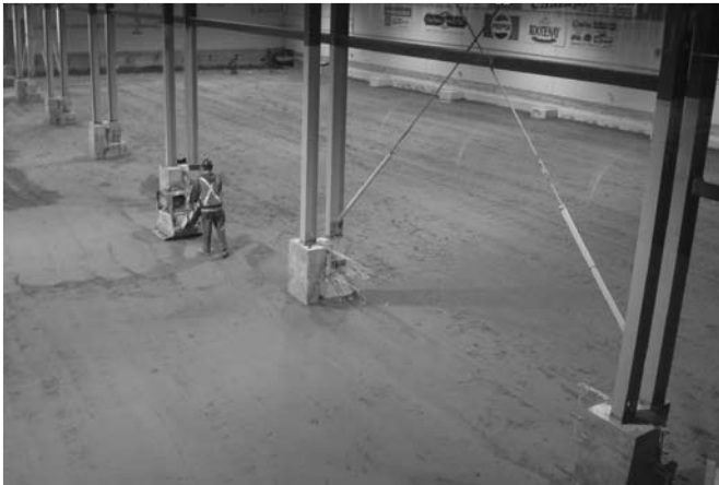
Curling Rink Floor