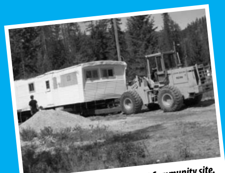
Placing of the mobile home at Community site.